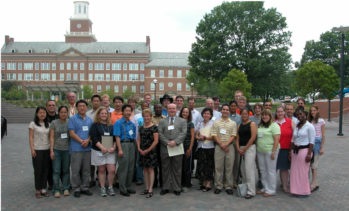
Figure 4: Summer 2004 REU Site program group at the University of Cincinnati.

freshman and sophomore students can benefit tremendously and also contribute to an REU program. It is also important to strive for gender parity and participation by underrepresented minorities. Prior to the formal REU program it is important that a dialogue be facilitated between the REU student and his/her faculty advisor and graduate mentor. It is also important to insure that the faculty advisor order in advance any equipment and supplies necessary for the student's research. An additional measure of hospitality in the form of picking up the students at the airport and being at the dormitories to help them move into their accommodations provides a nice 'personal touch' to get the REU program off to a positive start. A blend of technical, cultural, and social activities is critical to creating a meaningful and enjoyable program. In