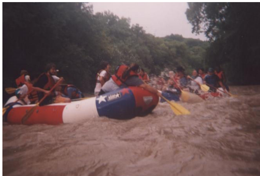
Figure 1: REU student teamwork during the raft trip on the Little Miami River.

The cultural and social program consisted of the following: tour of the Cincinnati Art Museum; raft trip on the Little Miami River; trip to Kings Island Amusement Park; weekly TGIF events; picnic and cornhole tournament; and end-of-the-summer picnic. The raft trip necessarily required teamwork and provided a great bonding experience as shown in Figure 1.