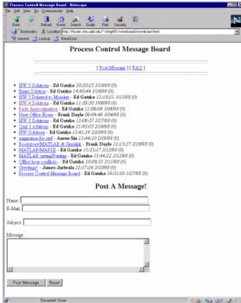
Figure 6: CHEG 401 Course Bulletin Board