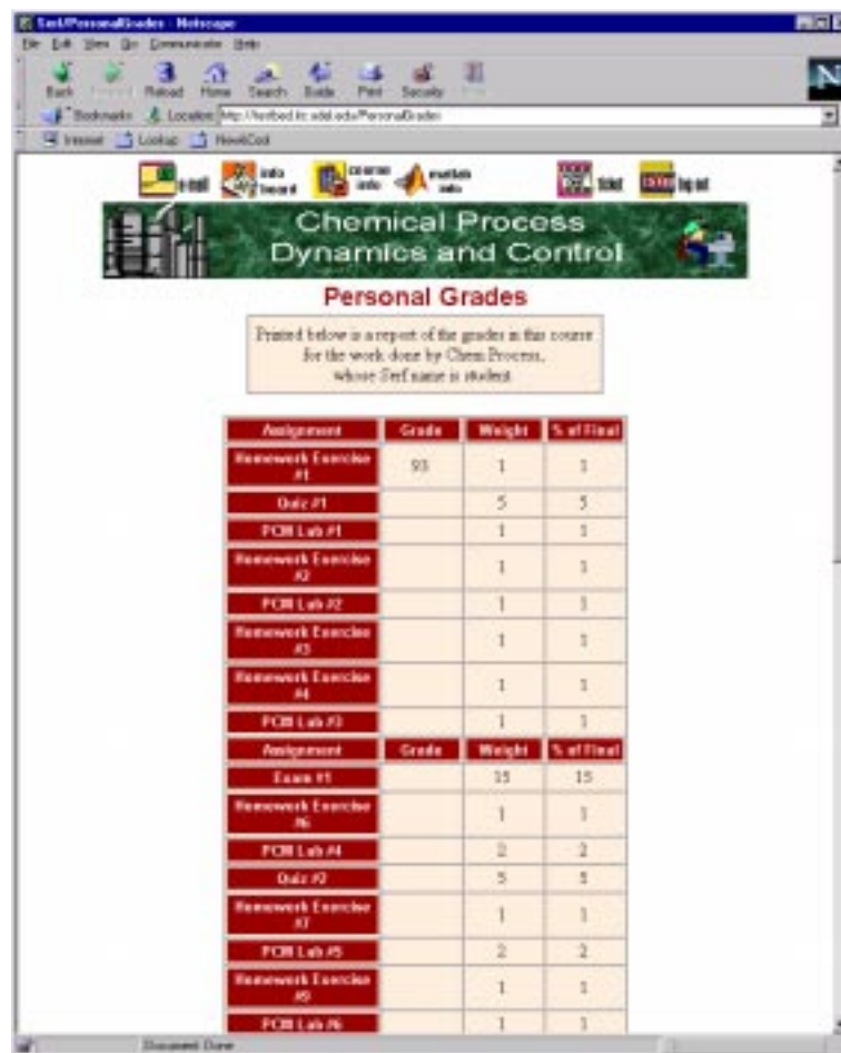
Figure 5: Student Access to Personal Grades