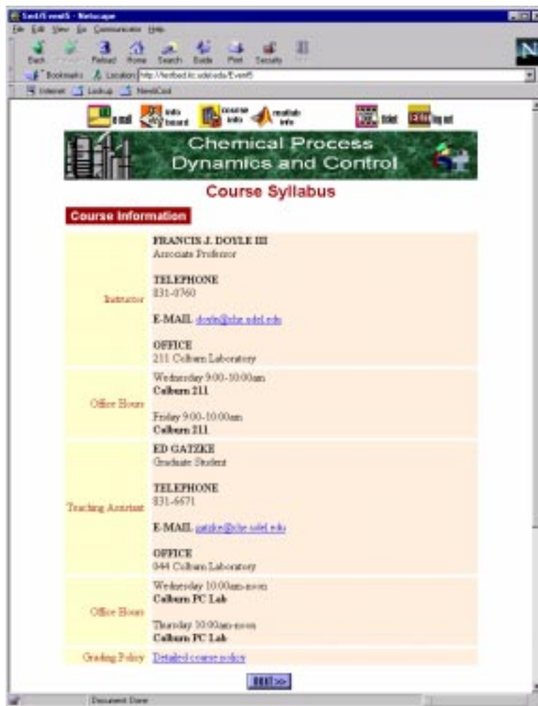
Figure 1: Student View of CHEG 401 Course Syllabus Using Serf

A good starting point for this exposition is the interface that the students encounter upon logging into the Serf account for CHEG 401 (Figure 1). Note the large course banner at the top of the screen, which can be customized with any standard graphics package (in this case, using a .gif file generated from Powerpoint). In addition, there are several icons above the banner which